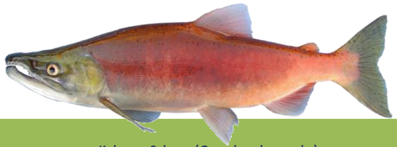
Kokanee Salmon ( Oncorhynchus nerka )