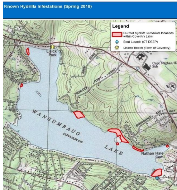
Known locations of hydrilla at Coventry Lake (Wangumbaug Lake). Boaters should avoid these areas noted with red to avoid fragmenting and spreading hydrilla.

HOUSATONIC RIVER (bridge closure). The CT Department of Transportation has announced that the covered bridge over the Housatonic River in West Cornwall will be closed to motor vehicle and pedestrian traffic from September 4 through October 2 for repairs.